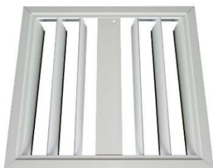
Air Actuated Shutter for 1220 Fan Only