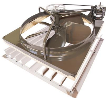
Air Actuated Shutter for 600, 760, 915 & 1070 Fans

High Efficiency 6 Blade Fan used for all fans except 600mm which has a 4 Blade Fan.